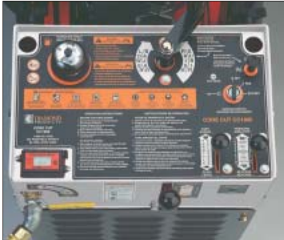
CC1800 Control Panel (remote throttle, choke and ignition switch are only available on 20 HP models)