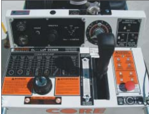
CC3500 Control Panel (shown with optional shaft tachometer and lowering speed metering valve)