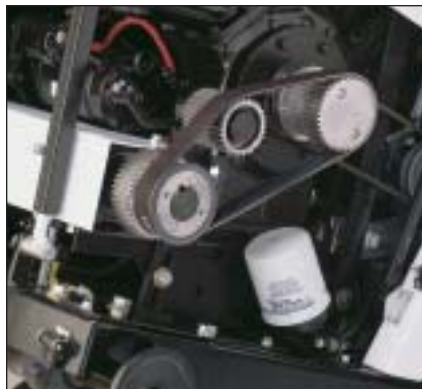
Easy accessible pulleys located in the front of the saw for quick saw speed adjustment