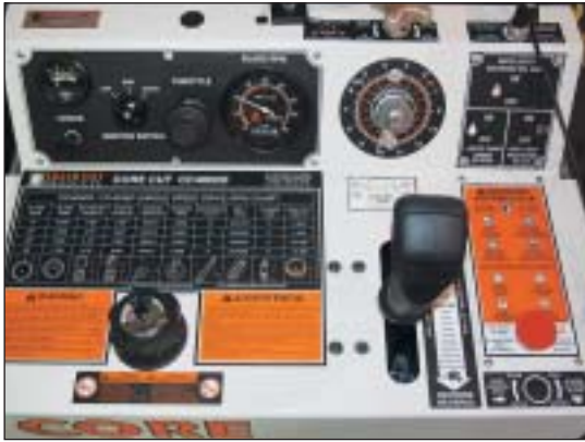
CC4000D Control Panel