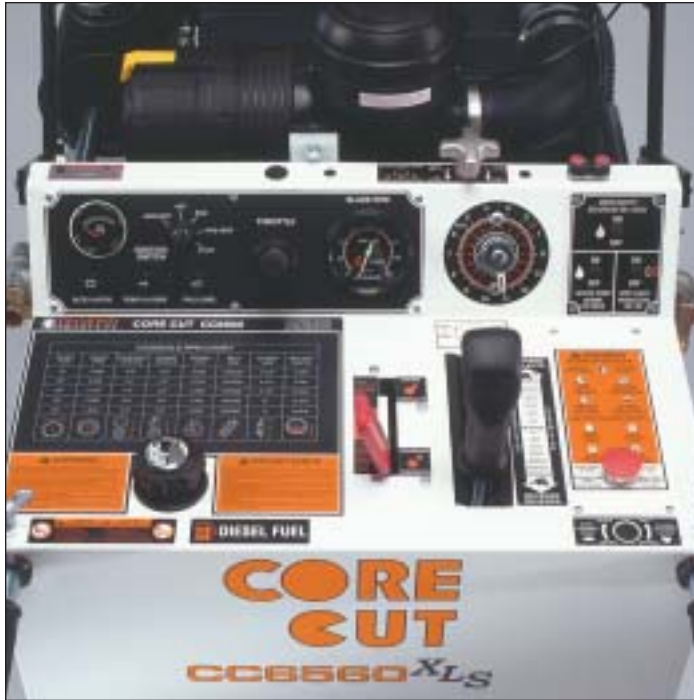
CC6560XLS Control Panel