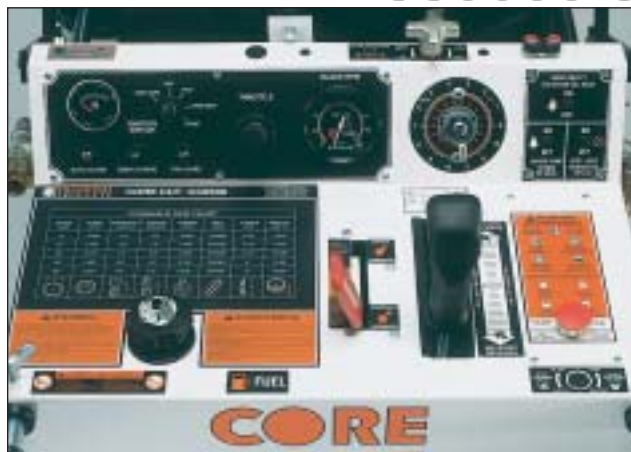
CC6500 Control Panel