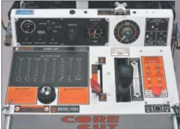
CC7100 Control Panel