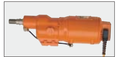
WEKA DK42 and DK42S 230V Very powerful, 3 Phase Part No. 4244022