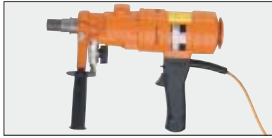
WEKA DK12 Hand held and portable Part No. 4244017