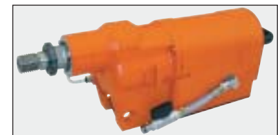
WEKA SR35 9 Speed 230V - 16 amp Part No. 4244064