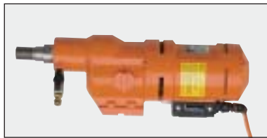
WEKA DK22 and DK22S 23 amp, 3 Speed, 110V Part No. 4244014