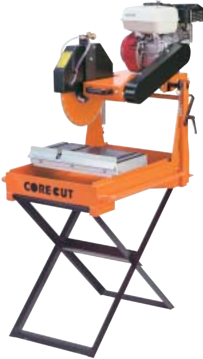
CC555M-H Gas Powered Saw (Shown with optional stand)

Many Operating and Convenience Features in a Variety of Power Options