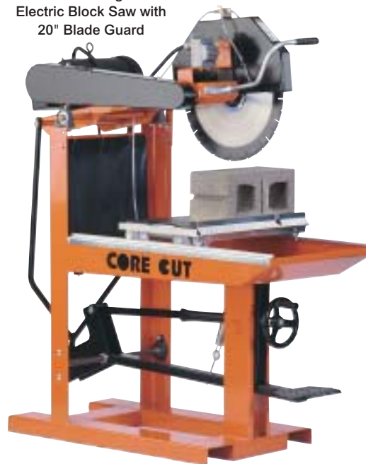
CC800M 5HP Single Phase Electric Block Saw with 20" Blade Guard