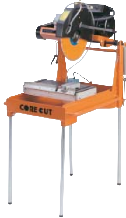
CC525M-E1 Electric Powered Saw (Shown with standard legs)