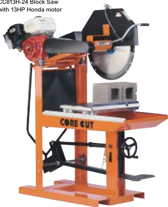
CC813H-24 Block Saw with 13HP Honda motor