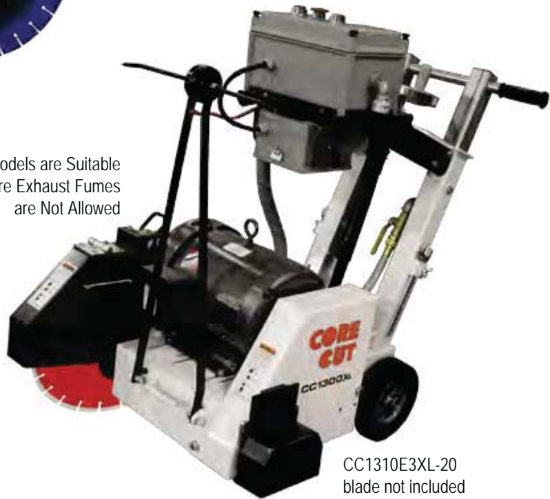
CC1310E3XL-20 blade not included

Electric Models are Suitable Where Exhaust Fumes are Not Allowed