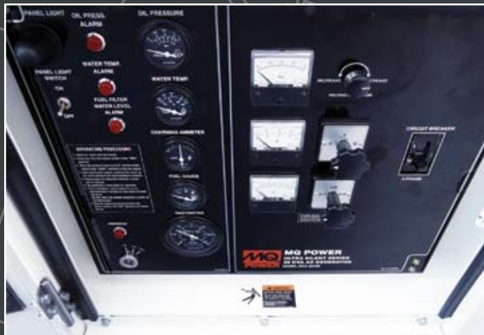
Easy-to-read instrument panel with analog controls giving the operator fingertip access to all generator functions