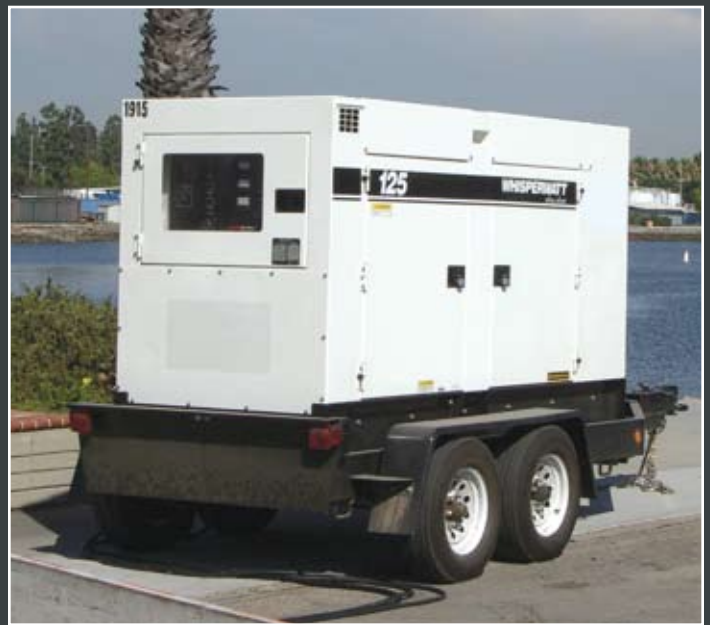
Each Ultra-Silent Series generator features our patented airflow design making them the quietest power sources on the market.

There are six single/three-phase models in the Ultra-Silent Series with outputs ranging from 25 to 150kVA. All are engineered with an integrated 24-hour fuel system and come standard with Tier II EPA-approved engines. A new patented airflow design reduces sound to the lowest levels ever. That's guaranteed to impress even the most demanding customers.