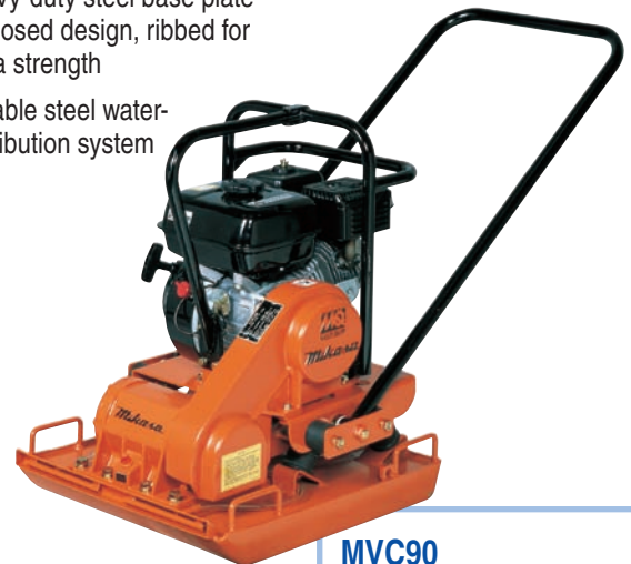
MVC90 3,350 lbs. centrifugal force