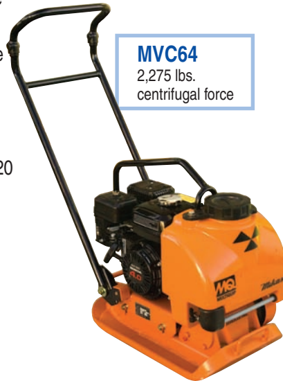
MVC64 2,275 lbs. centrifugal force