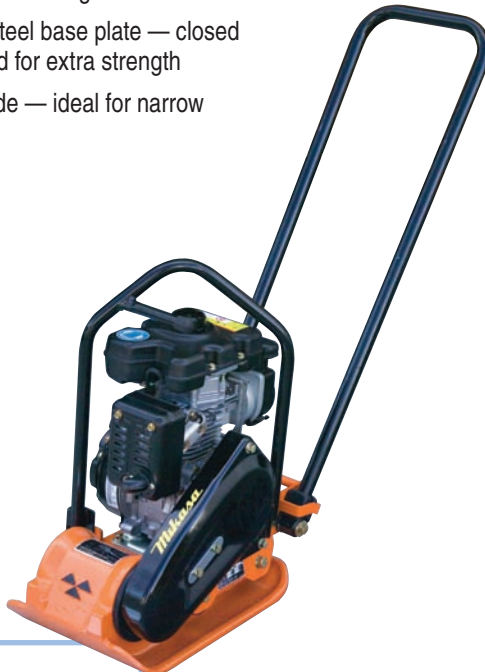
MVC40G 1,618 lbs. centrifugal force