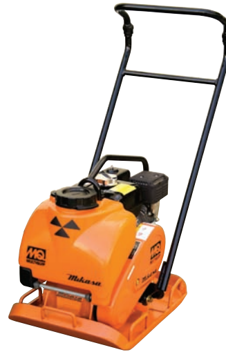
MVC82 3,080 lbs. centrifugal force