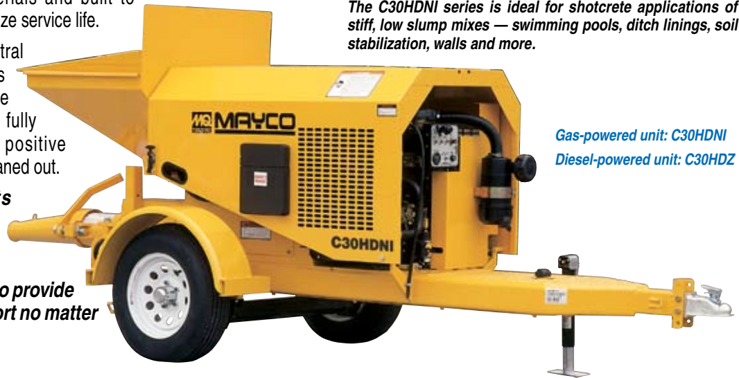
Gas-powered unit: C30HDNI Diesel-powered unit: C30HDZ