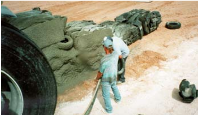
Shotcreting (wet gunning) with a stiff, low slump mix, is just one of the many uses for the LS60 concrete pump.