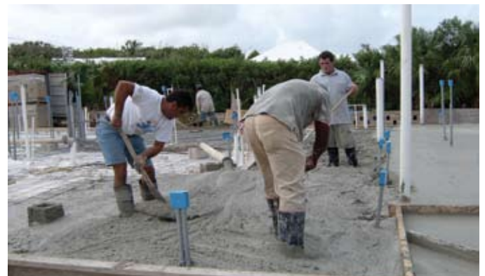
Long distances? Big slab? Low slump footings? Take a look at the new LS series concrete pumps.