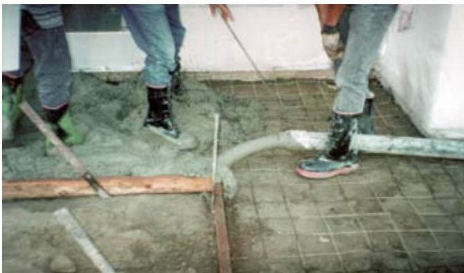
Low slump? Tough, rocky mixes? Hard to reach areas? The versatile LS series hydraulic concrete pumps handle it all!