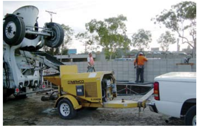
The masonry contractor's favorite for over 43 years. Don't leave for a load-bearing, block fill job without it.