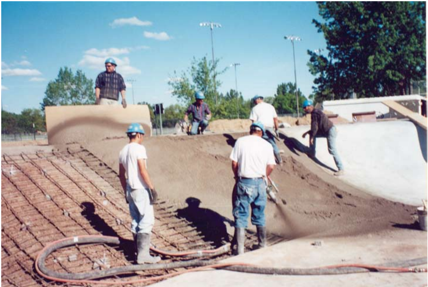
Shotcreting (wet gunning) with a stiff, low-slump shotcrete mix is all in a day's work for the Mayco C30HDNI.

All features and specifications are subject to change without notice.