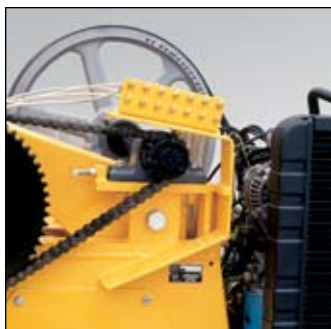
Central lubrication system for quick and easy maintenance.