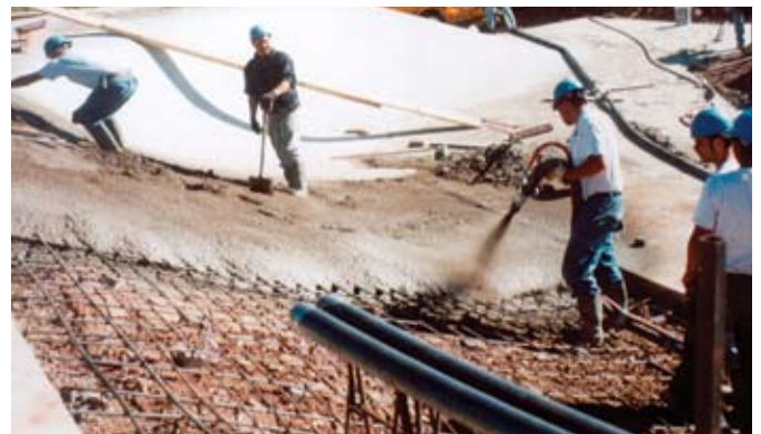
The Mayco LS40 — with its longer, slower stroke, and increased horsepower — will handle the toughest, low-slump shotcrete mixes.