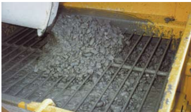
Too much rock? Poor quality pumping sand? The Mayco LS40 can efficiently place tough concrete pump mixes.