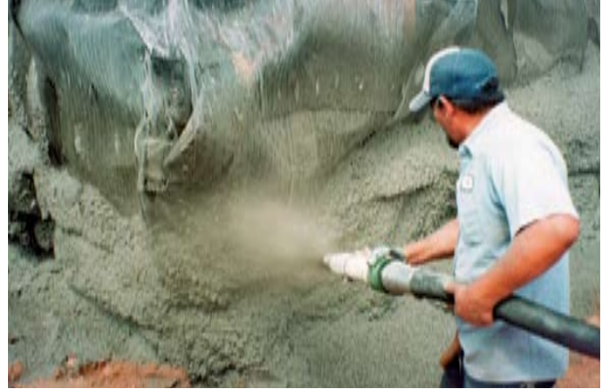
The C30HDNI series is ideal for shotcrete applications of stiff, low slump mixes — swimming pools, ditch linings, soil stabilization, walls and more.

Mayco replacement parts are reasonably priced and readily available. Additionally, our nationwide network of dealers is ready to provide service and technical support no matter where your job is located.