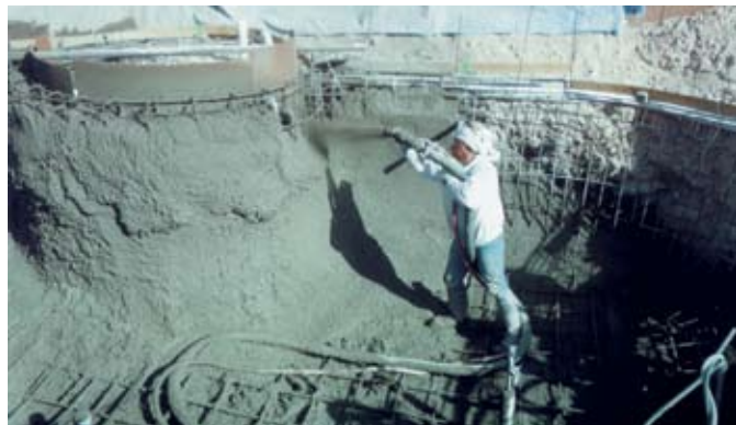
The LS50, with its powerful ability to handle the toughest shotcrete mixes, enables a swimming pool contractor to apply shotcrete to two pools a day.