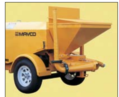
3" x 2" reducer is standard; swings up and away for easy travel and cleaning