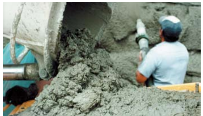
High volume shotcreting (wet gunning) with the adaptable LS40 is all in a day's work for this versatile concrete pump.