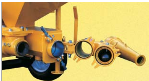
Innovative E-Z open hinged manifold and reducer; no special tools required for service or maintenance.