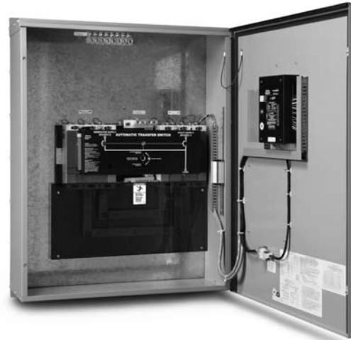
TS 840 - 400 AMP TRANSFER SWITCH