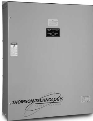
TS 840 - 400 AMP TRANSFER SWITCH