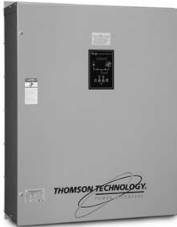
TS 870 - 400 AMP TRANSFER SWITCH