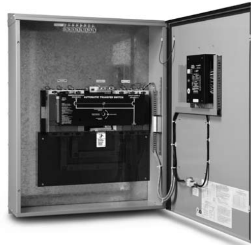
TS 870 - 400 AMP TRANSFER SWITCH